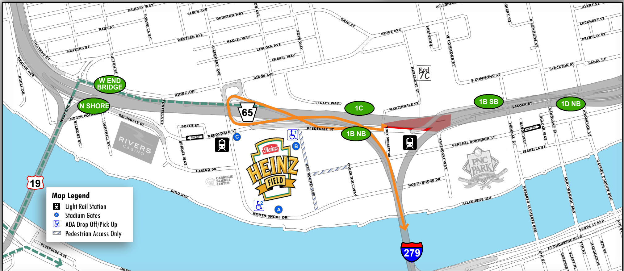
North Shore Campus Map