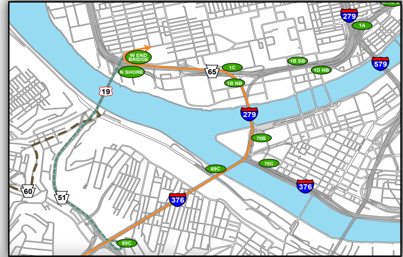
North Shore Campus Map