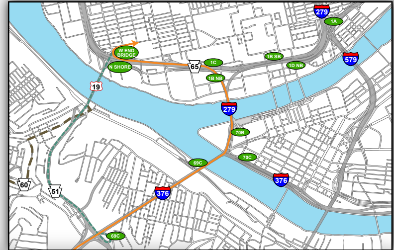
North Shore Campus Map